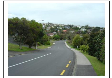
St. Ives Terrace

Children are not allowed in the carparks unless accompanied by an adult.